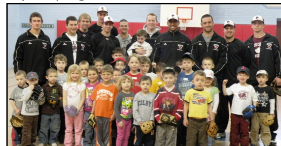
YMCA T-Ball players stop to pose for a picture with the Bates College Baseball Team

Thank you for joining all of us at NAPA in supporting this worthy cause by helping a child become a Y Kid!