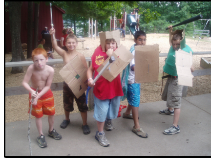
Camp Connor campers enjoy acting with their own creative props

Purpose: Each year, the YMCA invests resources to subsidize Membership and Program Fees for area youth to promote involvement in healthy, active programs.